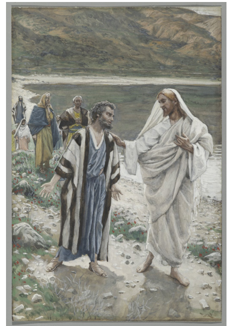
FEED MY LAMBS (PAIS MES BREBIS) from the series of THE LIFE OF OUR LORD JESUS CHRIST (LA VIE DE NOTRE-SEIGNEUR JÉSUS-CHRIST) 1886-1894 BY JAMES TISSOT. THE Brooklyn Museum.

He said to him, "Tend my sheep." He said to him the third time, "Simon, son of John, do you love me?" Peter was distressed that he had said to him a third time, "Do you love me?" and he said to him, "Lord, you know everything; you know that I love you." (Jesus) said to him, "Feed my sheep. Amen, amen, I say to you, when you were younger, you used to dress yourself and go where you wanted; but when you grow old, you will stretch out your hands, and someone else will dress you and lead you where you do not want to go." He said this signifying by what kind of death he would glorify God. And when he had said this, he said to him, "Follow me." This is the Truth. Peace be with you.