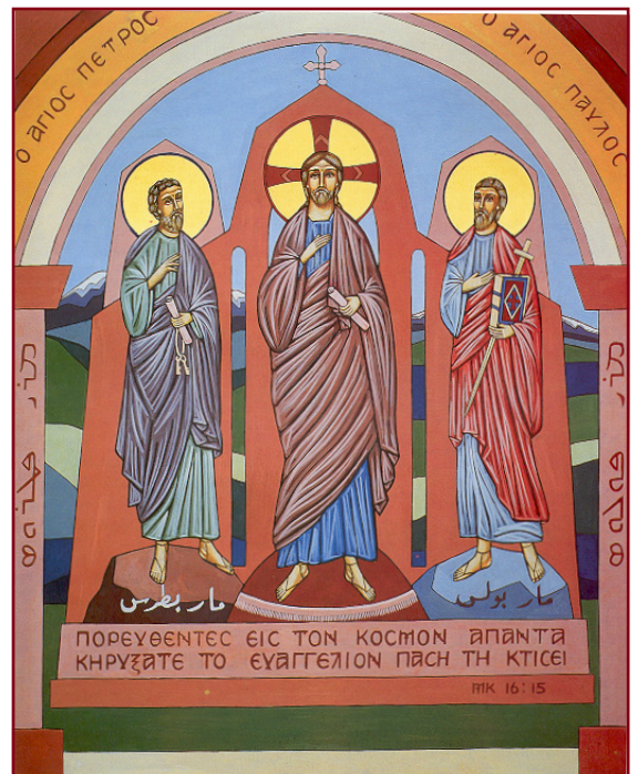
STs. PETER AND PAUL. The Maronite Icons: Modern Sacred Art. Dar Sader Publishers: Beirut 1999.