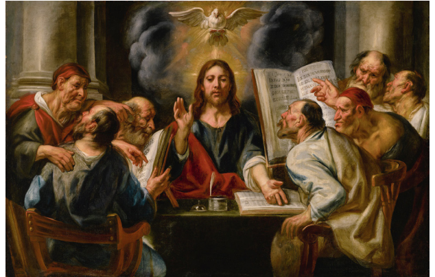
CHRIST AMONG THE PHARISEES, c. 1660 - 1670.

This was to fulfill what had been spoken through Isaiah the prophet: "Behold, my servant whom I have chosen, my beloved in whom I delight; I shall place my spirit upon him, and he will proclaim justice to the Gentiles. He will not contend or cry out, nor will anyone hear his voice in the streets. A bruised reed he will not break, a smoldering wick he will not quench, until he brings justice to victory. And in his name the Gentiles will hope."