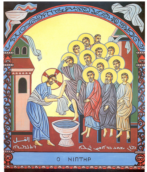
THE WASHING OF THE FEET. The Maronite Icons: Modern Sacred Art. Dar Sader Publishers: Beirut 1999.

My children, I will be with you only a little while longer. You will look for me, and as I told the Jews, 'Where I go you cannot come,' so now I say it to you. I give you a new commandment: love one another. As I have loved you, so you also should love one another. This is how all will know that you are my disciples, if you have love for one another." This is the Truth. Peace be with you.