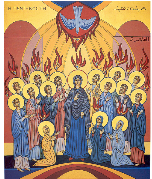
PENTECOST. The Maronite Icons: Modern Sacred Art. Dar Sader Publishers: Beirut 1999.

of truth, which the world cannot accept, because it neither sees nor knows it. But you know it, because it remains with you, and will be in you. I will not leave you orphans; I will come to you. In a little while the world will no longer see me, but you will see me, because I live and you will live. On that day you will realize that I am in my Father and you are in me and I in you.