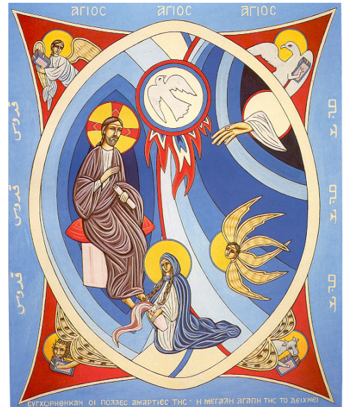
TRINITY SUNDAY. The Maronite Icons: Modern Sacred Art. Dar Sader Publishers: Beirut 1999.

Then Jesus approached and said to them, "All power in heaven and on earth has been given to me. Go, therefore, and make disciples of all nations, baptizing them in the name of the Father, and of the Son, and of the holy Spirit, teaching them to observe all that I have commanded you. And behold, I am with you always, until the end of the age."