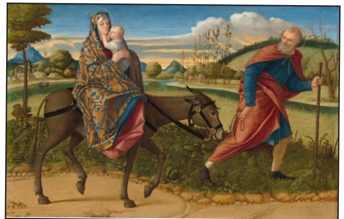
THE FLIGHT INTO EGYPT , c. 1515. Vittore Carpaccio. National Gallery of Art. Washington, D.C.

years old or under, according to the time that he had learned from the wise men. Then was fulfilled what had been spoken through the prophet Jeremiah: "A voice was heard in Ramah, wailing and loud lamentation, Rachel weeping for her children; she refused to be consoled, because they are no more." This is the truth. Peace be with you.