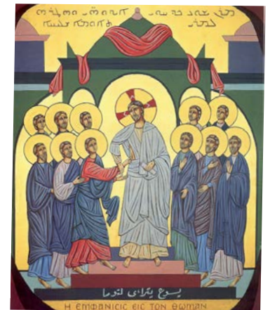
OUR LORD APPEARS TO THOMAS The Maronite Icons: Modern Sacred Art. Dar Sader Publishers: Beirut 1999.

Now a week later his disciples were again inside and Thomas was with them. Jesus came, although the doors were locked, and stood in their midst and said, "Peace be with you." Then he said to Thomas, "Put your finger here and see my hands, and bring your hand and put it into my side, and do not be unbelieving, but believe." Thomas answered and said to him, "My Lord and my God!" Jesus said to him, "Have you come to believe because you have seen me? Blessed are those who have not seen and have believed." Now Jesus did many other signs in the presence of (his) disciples that are not written in this book. But these are written that you may (come to) believe that Jesus is the Messiah, the Son of God, and that through this belief you may have life in his name. This is the Truth. Peace be with you.