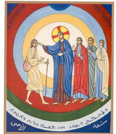
THE HEALING OF BARTIMAEUS THE BLIND The Maronite Icons: Modern Sacred Art. Dar Sader Publishers: Beirut 1999.

calling out all the more, "Son of David, have pity on me." Jesus stopped and said, "Call him." So they called the blind man, saying to him, "Take courage; get up, he is calling you." He threw aside his cloak, sprang up, and came to Jesus. Jesus said to him in reply, "What do you want me to do for you?" The blind man replied to him, "Master, I want to see." Jesus told him, "Go your way; your faith has saved you." Immediately he received his sight and followed him on the way. This is the Truth. Peace be with you.