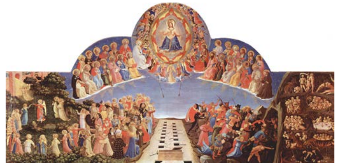
THE LAST JUDGMENT by Fra Angelico c. 1431 Museum of San Marco, Florence

thirsty and you gave me something to drink, I was a stranger and you welcomed me, I was naked and you gave me clothing, I was sick and you took care of me, I was in prison and you visited me.' Then the righteous will answer him, 'Lord, when was it that we saw you hungry and gave you food, or thirsty and gave you something to drink? And when was it that we saw you a stranger and welcomed you, or naked and gave you clothing? And when was it that we saw you sick or in prison and visited you?' And the king will answer them, 'Truly I tell you, just as you did it to one of the least of these who are members of my