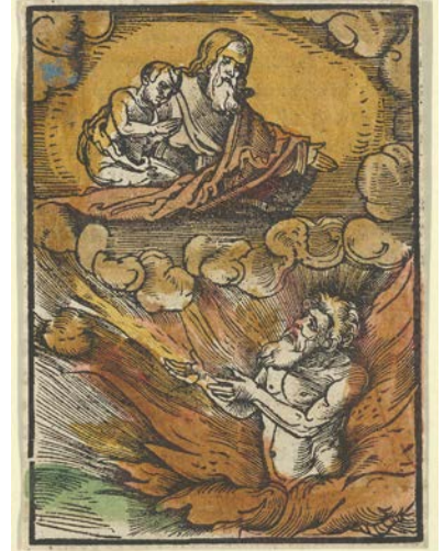
THE RICH MAN IN HELL AND THE POOR LAZARUS IN ABRAHAM'S LAP from Das Plenarium by Hans Schäufelein, 1517 Metropolitan Museum of Art, New York

the dogs would come and lick his sores. The poor man died and was carried away by the angels to be with Abraham. The rich man also died and was buried. In Hades, where he was being tormented, he looked up and saw Abraham far away with Lazarus by his side. He called out, 'Father Abraham, have mercy on me, and send Lazarus to dip the tip of his finger in water and cool my tongue; for I am in agony in these flames.' But Abraham said, 'Child, remember that during your lifetime you received your good things, and Lazarus in like manner evil things; but now he is comforted here, and you are in agony. Besides all this, between you and us a great chasm has been fixed, so that those who might want to pass from here to you cannot do so, and no one can cross from there to us.' He said, 'Then, father, I beg you to send him to my father's house — for I have five brothers — that he may warn