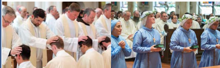
St. John Vianney Theological Seminary May 2017

My Good and Beloved Father, direct our children to be open to Your will. Keep them in the palm of Your hand. Send Your Spirit to guide them in their decision to serve all men for Your sake. Bestow Your graces upon our young men and women who desire to serve You wholeheartedly. May Your will be done in their precious lives. Amen.