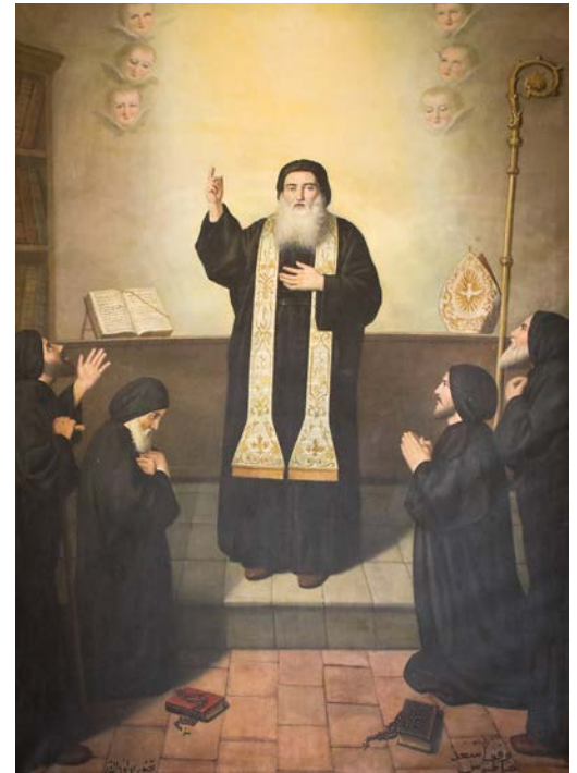
ST. MARON OF LEBANON AND HIS DISCIPLES The painting from 1863 is in the Saint Maroun parish church of Jezzine

The Lord Jesus says, "The hour has come for the Son of Man to be glorified. Amen, Amen I say to you, unless a grain of wheat falls to the ground and dies, it remains just a grain of wheat; but if it dies, it produces much fruit. Whoever loves his life loses it, and whoever hates his life in this world will preserve it for eternal life. Whoever serves me must follow me, and where I am, there also will my servant be. The Father will honor whoever serves me. "I am troubled now. Yet what should I say—"Father, save me from this hour"? But it was for this purpose that I came to this hour. Father, glorify your name." Then a voice came from heaven, "I have glorified it, and will glorify it again." The crowd there heard it and said it was thunder; But others said, "An angel has spoken to him." Jesus answered and said, "This voice did not come for my sake but for yours. This is the truth. Peace be with you.