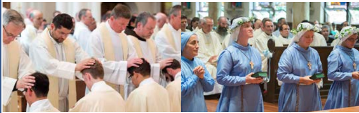
St. John Vianney Theological Seminary May 2017

My Good and Beloved Father, direct our children to be open to Your will. Keep them in the palm of Your hand. Send Your Spirit to guide them in their decision to serve all men for Your sake. Bestow Your graces upon our young men and women who desire to serve You wholeheartedly. May Your will be done in their precious lives. Amen.