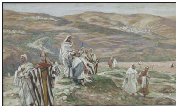
HE SENT THEM OUT TWO BY TWO (IL LES ENVOYA DEUX A DEUX.) From the series LA VIE DE NOTRE-SEIGNEUR JÉSUS-CHRIST, 1886-1894, by James Tissot. THE Brooklyn Museum.

The theme of this week's Gospel is: We are all missionaries at work, in our parish, in our family, and in society. Our Lord Jesus Christ gives us grace to speak truth with love and to suffer with purpose. Am I living my faith everyday with the presence of Jesus Christ in my life?