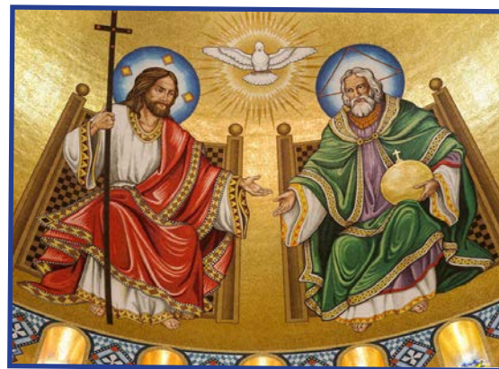
DETAIL FROM THE TRINITY DOME IN THE BASILICA OF THE NATIONAL SHRINE OF THE IMMACULATE CONCEPTION IN WASHINGTON DC.

Whoever has my commandments and observes them is the one who loves me. And whoever loves me will be loved by my Father, and I will love him and reveal myself to him." Judas, not the Iscariot, said to him, "Master, (then) what happened that you will reveal yourself to us and not to the world?" Jesus answered and said to him, "Whoever loves me will keep my word, and my Father will love him, and we will come to him and make our dwelling with him. Whoever does not love me does not keep my words; yet the word you hear is not mine but that of the Father who sent me. "I have told you this while I am with you. The Advocate, the holy Spirit that the Father will send in my name--he will teach you everything and remind you of all that (I) told you. Peace I leave with you; my peace I give to you. Not as the world gives do I give it to you. Do not let your hearts be troubled or afraid."