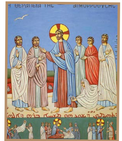
THE HEALING OF THE HEMORRHAGING WOMAN The Maronite Icons: Modern Sacred Art. Dar Sader Publishers: Beirut 1999.

When Jesus returned, the crowd welcomed him, for they were all waiting for him. And a man named Jairus, an official of the synagogue, came forward. He fell at the feet of Jesus and begged him to come to his house, because he had an only daughter, about twelve years old, and she was dying. As he went, the crowds almost crushed him. And a woman afflicted with hemorrhages for twelve years, who (had spent her whole livelihood on doctors and) was unable to be cured by anyone, came up behind him and touched the tassel on his cloak. Immediately her bleeding stopped. Jesus then asked, "Who touched me?" While all were denying it, Peter said, "Master, the crowds are pushing and pressing in upon you." But Jesus said, "Someone has touched me; for I know that power has gone out from me." When the woman realized that she had not escaped notice, she came forward trembling. Falling down before