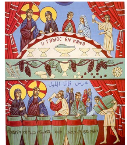
THE MIRACLE AT CANA. The Maronite Icons: Modern Sacred Art. Dar Sader Publishers: Beirut 1999.

On the third day there was a wedding in Cana in Galilee, and the mother of Jesus was there. Jesus and his disciples were also invited to the wedding. When the wine ran short, the mother of Jesus said to him, "They have no wine." (And) Jesus said to her, "Woman, how does your concern affect me? My hour has not yet come." His mother said to the servers, "Do whatever he tells you." Now there were six stone water jars there for Jewish ceremonial washings, each holding twenty to thirty gallons. Jesus told them, "Fill the jars with water." So they filled them to the brim. Then he told them, "Draw some out now and take it to the headwaiter." So they took it. And when the headwaiter tasted the water that had become wine, without knowing where it came from (although the servers who had drawn the water knew), the headwaiter called the bridegroom and said to him, "Everyone serves good wine first, and then when people have drunk freely, an inferior one; but you have kept the good wine until now." Jesus did this as the beginning of his signs in Cana in Galilee and so revealed his glory, and his disciples began to believe in him. This is the Truth. Peace be with you.