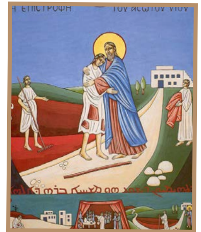
THE RETURN OF THE PRODIGAL SON The Maronite Icons: Modern Sacred Art. Dar Sader Publishers: Beirut 1999.

Then he said, "A man had two sons, and the younger son said to his father, 'Father, give me the share of your estate that should come to me.' So the father divided the property between them. After a few days, the younger son collected all his belongings and set off to a distant country where he squandered his inheritance on a life of dissipation. When he had freely spent everything, a severe famine struck that country, and he found himself in dire need. So he hired himself out to one of the local citizens who sent him to his farm to tend the swine. And he longed to eat his fill of the pods on which the swine fed, but nobody gave him any. Coming to his senses he thought, 'How many of my father's hired workers have more than enough food to eat, but here am I, dying from hunger. I shall get up and go to my father and I shall say to him, "Father, I have sinned against heaven and against you. I no longer deserve to be called your son; treat me as you would treat one of your hired workers.'" So he got up and went back to his father. While he