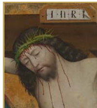
The Liesborn Altarpiece: Head of Christ Crucified. c 1480s. London: The National Gallery

As a reminder for those who want to make a donation for the Easter flowers that will adorn our church, the last day we will be able to accept donations and have your intentions printed in the Easter handout, will be April 6 .