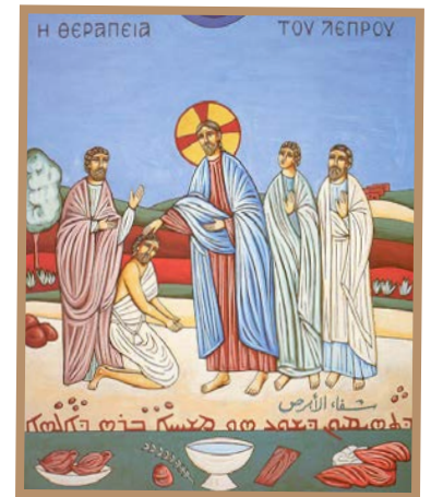
THE HEALING OF THE LEPER. The Maronite Icons: Modern Sacred Art. Dar Sader Publishers: Beirut 1999.

Rising very early before dawn, he left and went off to a deserted place, where he prayed. Simon and those who were with him pursued him and on finding him said, "Everyone is looking for you." He told them, "Let us go on to the nearby villages that I may preach there also. For this purpose have I come." So he went into their synagogues, preaching and driving out demons throughout the whole of Galilee. A leper came to him (and kneeling down) begged him and said, "If you wish, you can make me clean." Moved with pity, he stretched out his hand, touched him, and said to him, "I do will it. Be made clean." The leprosy left him immediately, and he was made clean. Then, warning him sternly, he dismissed him at once. This is the Truth. Peace be with you.