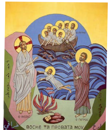
THE APPEARANCE OF JESUS TO THE APOSTLES BY THE SEA The Maronite Icons: Modern Sacred Art. Dar Sader Publishers: Beirut 1999.

him, "We also will come with you." So they went out and got into the boat, but that night they caught nothing. When it was already dawn, Jesus was standing on the shore; but the disciples did not realize that it was Jesus. Jesus said to them, "Children, have you caught anything to eat?" They answered him, "No." So he said to them, "Cast the net over the right side of the boat and you will find something." So they cast it, and were not able to pull it in because of the number of fish. So the disciple whom Jesus loved said to Peter, "It is the Lord." When Simon Peter heard that it was the Lord, he tucked in his garment, for he was lightly clad, and jumped into the sea. The other disciples came in the boat, for they were not far from shore, only about a hundred yards, dragging the net with the fish. When they climbed out on shore, they saw a charcoal