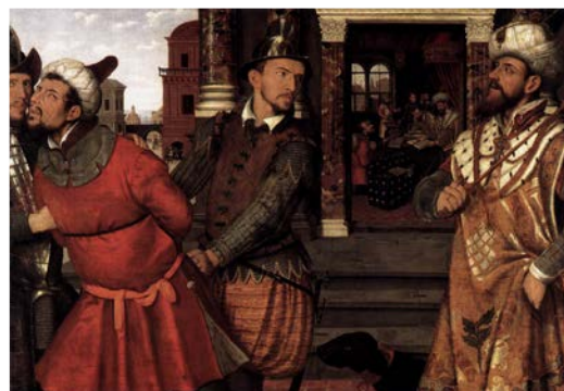
Parable of the Wicked Servant by an Unknown German Master, active in the northern Germany in the 1560s. Gemäldegalerie, Berlin

"Who, then, is the faithful and prudent servant, whom the master has put in charge of his household to distribute to them their food at the proper time? Blessed is that servant whom his master on his arrival finds doing so. Amen, I say to you, he will put him in charge of all his property. But if that wicked servant says to himself, 'My master is long delayed,' and begins to beat his fellow servants, and eat and drink with drunkards, the servant's master will come on an unexpected day and at an unknown hour and will punish him severely and assign him a place with the hypocrites, where there will be wailing and grinding of teeth."