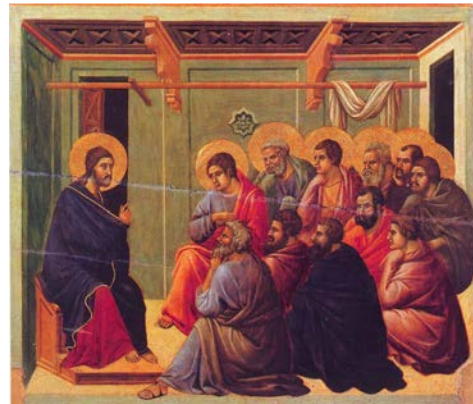
CHRIST TAKING LEAVE OF THE APOSTLES. Duccio di Buoninsegna 1308-11. Museo dell'Opera del Duomo, Siena.

Then James and John, the sons of Zebedee, came to him and said to him, "Teacher, we want you to do for us whatever we ask of you." He replied, "What do you wish (me) to do for you?" They answered him, "Grant that in your glory we may sit one at your right and the other at your left." Jesus said to them, "You do not know what you are asking. Can you drink the cup that I drink or be baptized with the baptism with which I am baptized?" They said to him, "We can." Jesus said to them, "The cup that I drink, you will drink, and with the baptism with which I am baptized, you will be baptized; but to sit at my right or at my left is not mine to give but is for those for whom it has been prepared." When the ten heard this, they became indignant at James and John. Jesus summoned them and said to them, "You know that those who are recognized as rulers over the Gentiles lord it over them, and their great