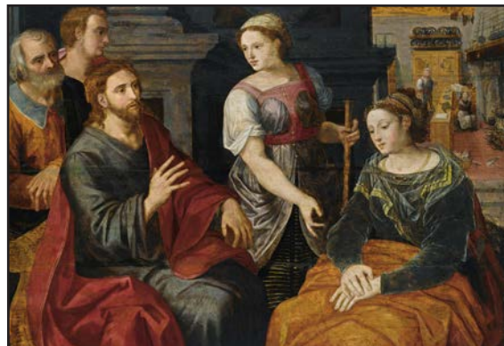
CHRIST IN THE HOUSE OF MARTHA AND MARY. Willem Key (1515-1568)

As they continued their journey he entered a village where a woman whose name was Martha welcomed him. She had a sister named Mary (who) sat beside the Lord at his feet listening to him speak.